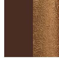
Coffee / Bronze Leaf - CBL